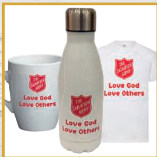
Love God Love Others