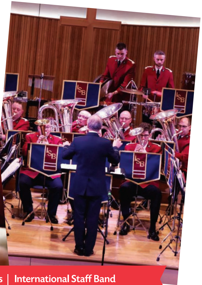
International Staff Songsters | International Staff Band

The International Staff Songsters is at the forefront of Salvation Army vocal music making in the UK and around the world.