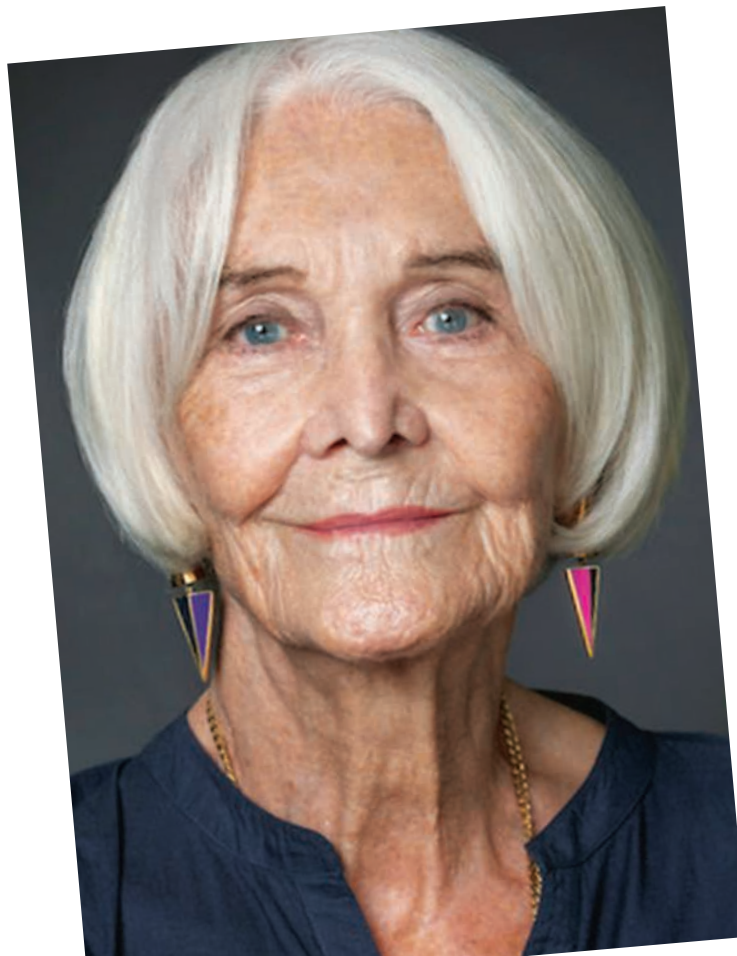
Dame Sheila Hancock

Sheila's extensive career has ranged from the original West End casts of Sweeney Todd , Annie and Sister Act to being the first Woman Artistic Director of the RSC's tour; from playing Ranyevskaya in The Cherry Orchard at the Royal National Theatre to Celebrity Gogglebox ; and from Senna Pod in Carry on Cleo to winning an Olivier Award for her performance as Fraulein Schneider in Cabaret .