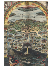
In Darkest England and the Way Out